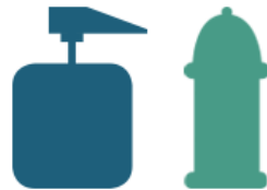
Condoms & lubricants fact sheet

HIV is most commonly passed on through sex. Find out how you can protect yourself and your partner.