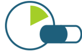
Emergency HIV treatment (PEP) fact sheet

The only way to know if you have HIV is to take a test. Find out what to expect.