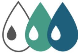
HIV transmission fact sheet

You may find these useful for your own personal knowledge, to share with friends or colleagues, or to use in the workplace or schools to educate others.