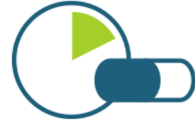
Emergency HIV treatment (PEP) fact sheet

The only way to know if you have HIV is to take a test. Find out what to expect.