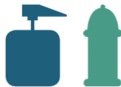
Condoms & lubricants fact sheet

HIV is most commonly passed on through sex. Find out how you can protect yourself and your partner.