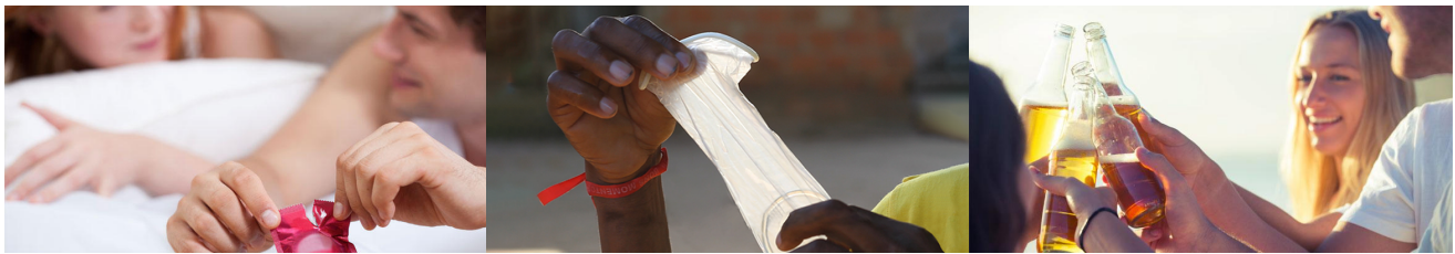
Condoms - how to use a male condom

If you know how to have safer sex it can make you feel more relaxed and comfortable when having sex.