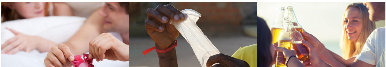
Condoms - how to use a male condom

If you know how to have safer sex it can make you feel more relaxed and comfortable when having sex.