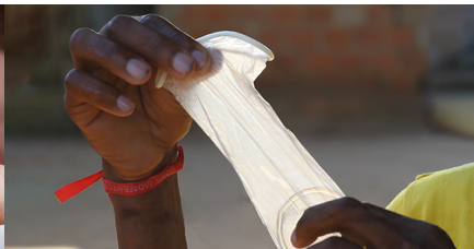
Female condoms - how to use a female condom

Condoms are worn by a man to stop pregnancy and STIs from unprotected sex.