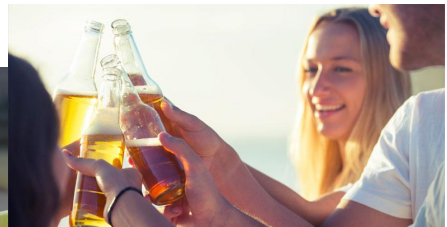
Alcohol, drugs, sex & HIV

Female condoms are worn inside a woman's vagina to stop STIs and pregnancy.