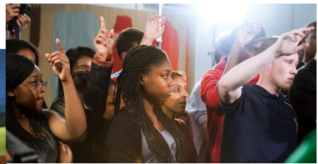
Am I ready for sex?

Sexuality can be exciting and confusing but you're not the only one working it out.