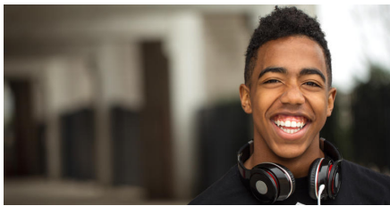
Puberty information for boys and girls

Find out what to expect during puberty like new feelings or body changes.