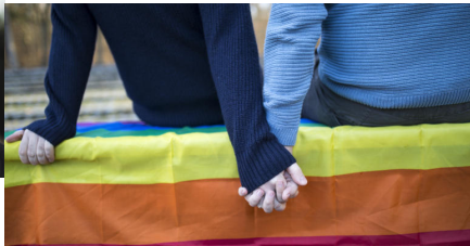
Sexuality: am I gay, lesbian or bisexual?

Find out what to expect during puberty like new feelings or body changes.