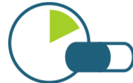
Emergency HIV treatment (PEP) fact sheet

Learn how HIV is passed on so that you can protect yourself from the virus.