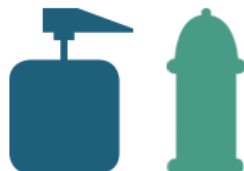
Condoms & lubricants fact sheet

Unprotected sex can lead to HIV and other STIs. Protect yourself during sex.