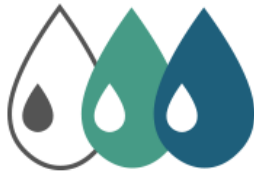
HIV transmission fact sheet

You may find these useful for your own personal knowledge, to share with friends or colleagues, or to use in the workplace or schools to educate others.