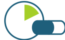
Emergency HIV treatment (PEP) fact sheet

The only way to know if you have HIV is to take a test. Find out what to expect.