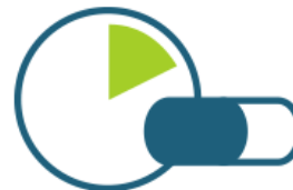
Emergency HIV treatment (PEP) fact sheet

The only way to know if you have HIV is to take a test. Find out what to expect.