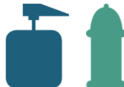
Condoms & lubricants fact sheet