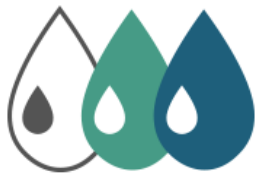
HIV transmission fact sheet