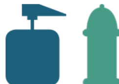
Condoms & lubricants fact sheet

Unprotected sex can lead to HIV and other STIs. Protect yourself during sex.