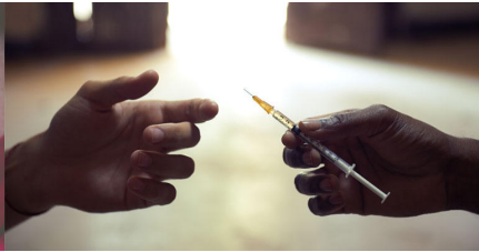
People who inject drugs (PWID)

14% of all people who inject drugs are living with HIV. People who inject drugs are repeatedly denied access to harm reduction programmes.