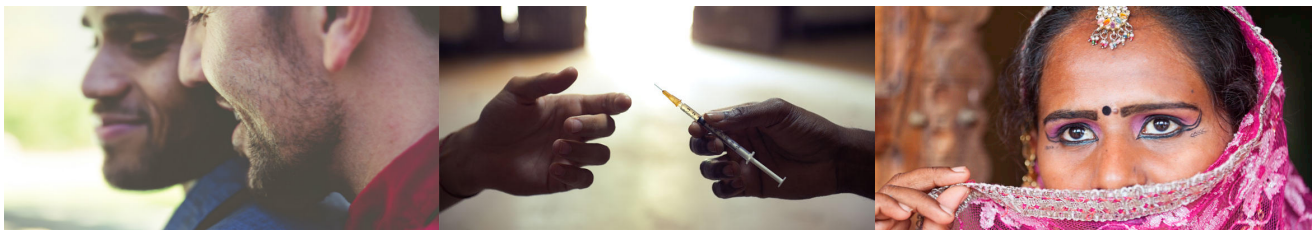
Men who have sex with men (MSM)

An effective response to the HIV epidemic requires that these groups are targeted by HIV prevention programmes with information and services that are specific to them.