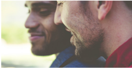
Men who have sex with men (MSM)

Homosexual acts are illegal in more than a third of countries, preventing men who have sex with men (MSM) from accessing HIV services.