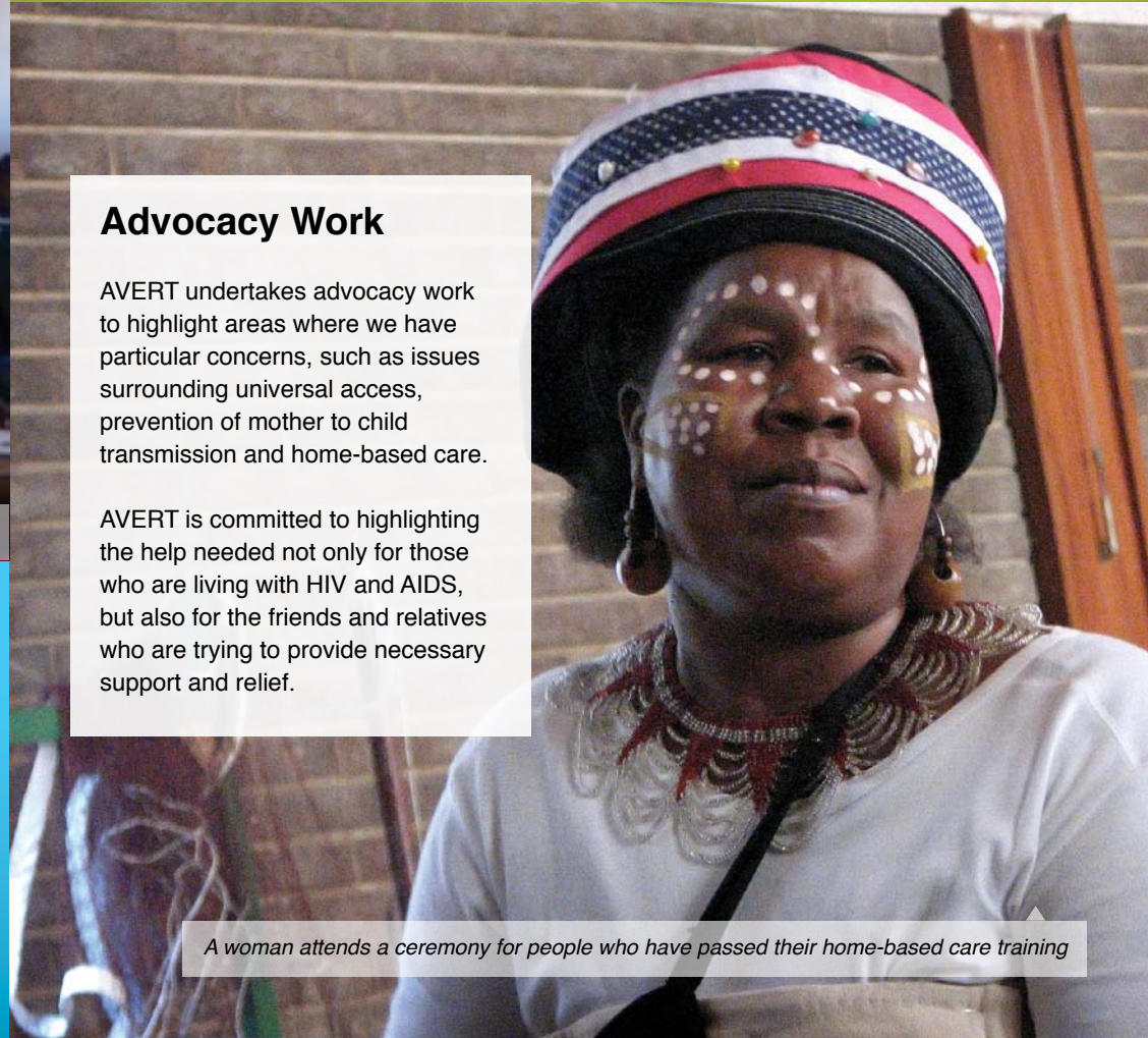
A woman attends a ceremony for people who have passed their home-based care training

AVERT is committed to highlighting the help needed not only for those who are living with HIV and AIDS, but also for the friends and relatives who are trying to provide necessary support and relief.