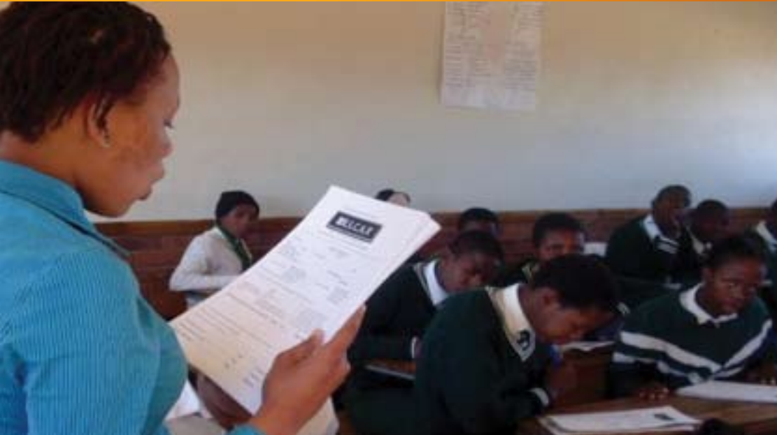
OSCAR Project staff working with school students in KwaZulu-Natal

AVERT also provides information on current developments in HIV and AIDS news, both through the website and the regular updates posted on AVERT's social media network.