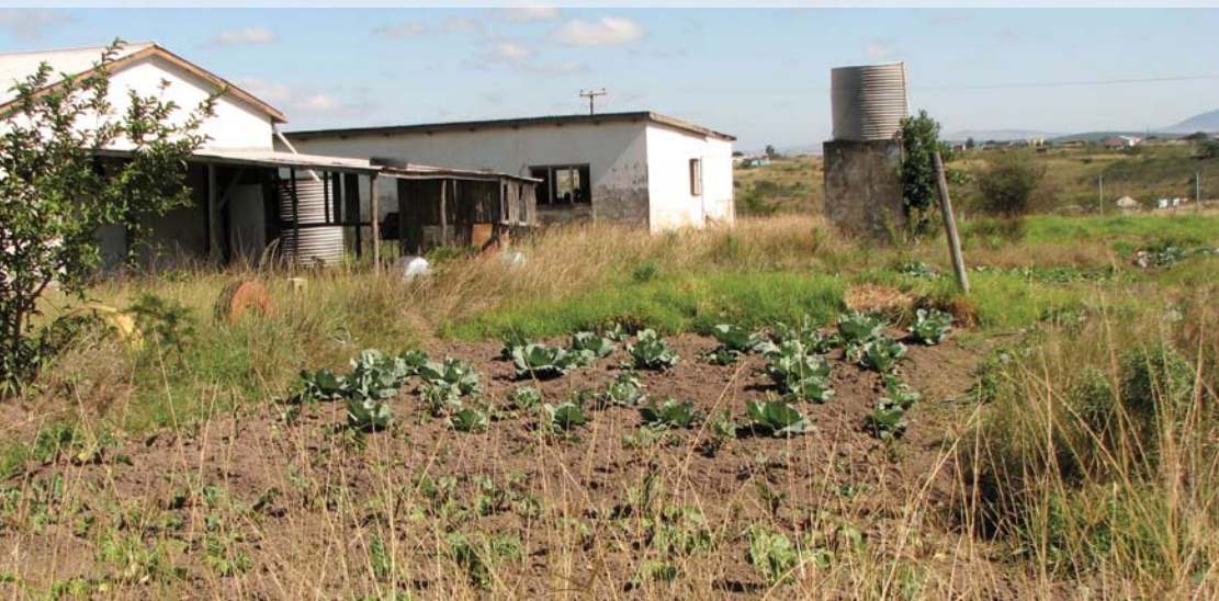
Community action growing vegetables to feed the AIDS orphans at the Sisonke project

Funding for Sisonke has meant that people are now trained in how to offer targeted home-based care to HIV positive individuals. Members of the community have been equipped with the tools, such as food gardens and goat rearing projects, to live more sustainable and healthy lives. Sisonke has also established social support groups for the elderly carers of orphans and vulnerable children.