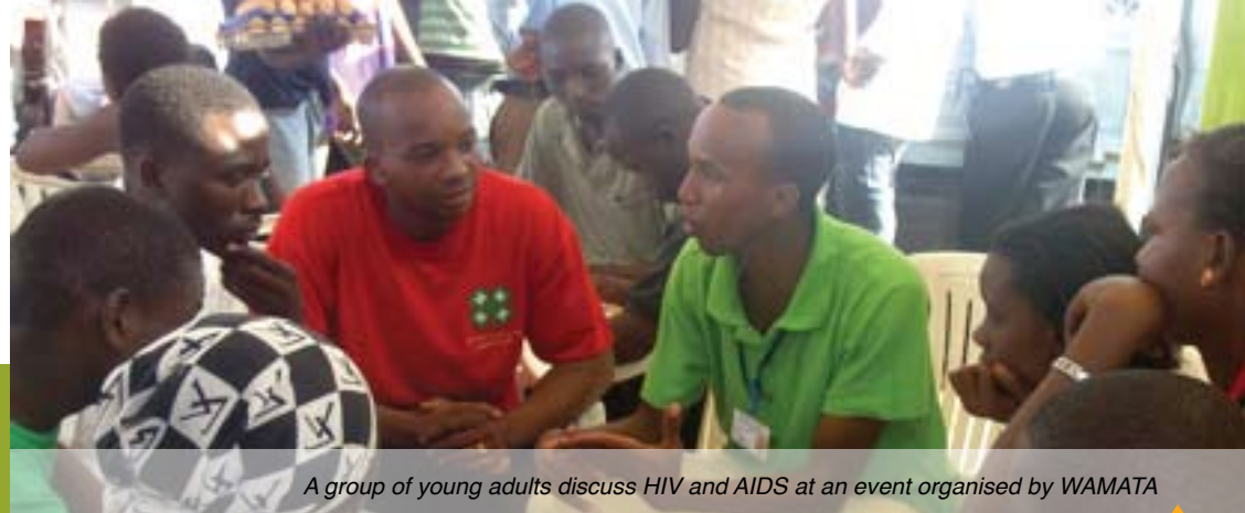
A group of young adults discuss HIV and AIDS at an event organised by WAMATA