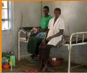
A new mother sits with her midwife after labour, Uganda

AVERT support has so far enabled 10 health unit workers to receive training, building the staff capacity of HIV treatment and testing centres in the district. This in turn enables more HIV positive pregnant women in the area to obtain treatment – effectively saving lives.